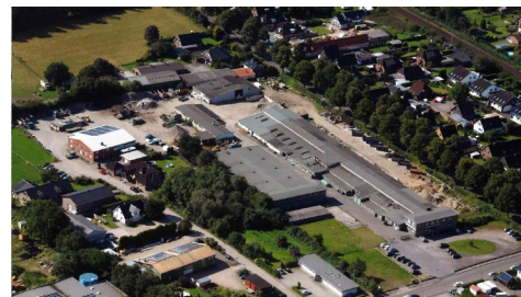
KAISER, SPECIAL MOTORS, GERMANY KAISER, SONDERMOTOREN, DEUTSCHLAND