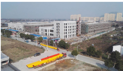
OMEC LTD, PRODUCTION SITE (ready: summer 2019) OMEC LTD, FERTIGUNGSWERK (fertigstellung: Sommer 2019)