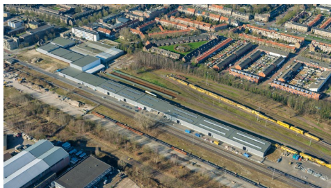
PEJA GROUP & OMEC MOTORS N.V., H.Q. HAUPTSITZ DER PEJA GRUPPE UND OMEC MOTORS N.V.